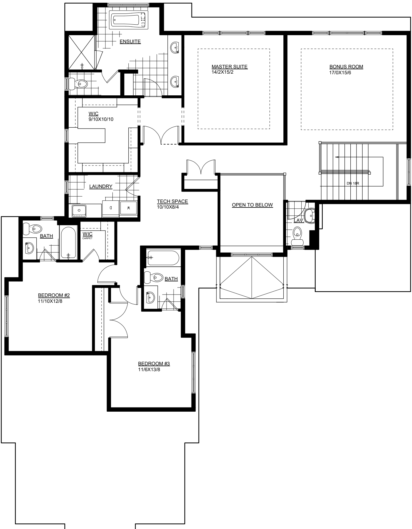
UPPER FLOOR PLAN 1804.0 SQ.FT.